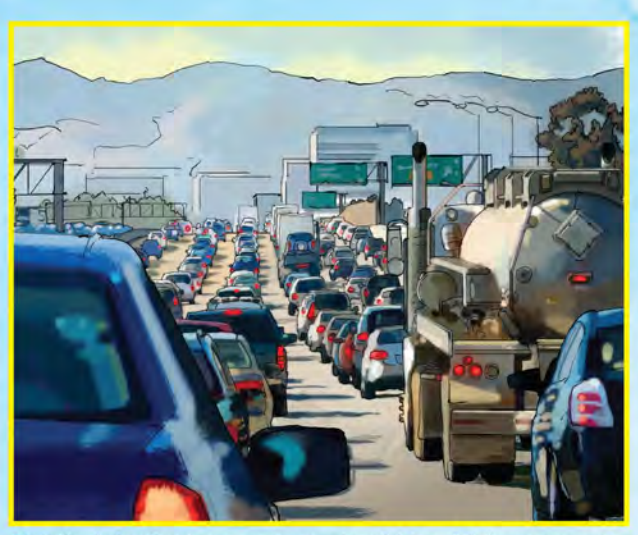
Gridlock isn't where anyone should be. Make your commute less stressful by taking the bus or train.

Long Beach Transit buses accept TAP cards, the TAP app and cash (but you need to have the exact fare). Metro trains and subways do not accept cash. Riders use a TAP card, the TAP app or Apple Wallet instead. For Metro riders, paying by TAP includes two hours of free one-way transfers on Metro buses and trains with each paid fare. Your TAP card also gives you access to 26 transit systems across Los Angeles County.