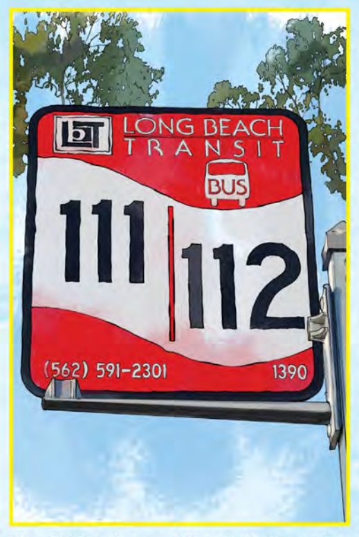
The 2024 Lakewood Transit Guide makes getting around the Southland quicker and easier.

Long Beach Transit operates nearly a dozen bus routes in Lakewood. Many of them connect to downtown Long Beach. Many routes also serve Lakewood Center or connect Lakewood to adjacent cities.