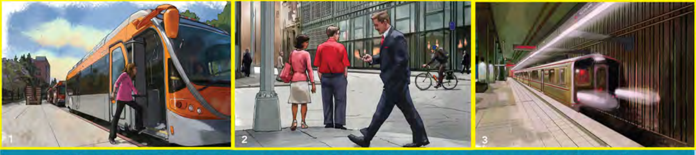
Metro offers both local and express routes. 2. Daily walking provides a wide range of health benefits. Service is frequent and fast on Metro rail lines.