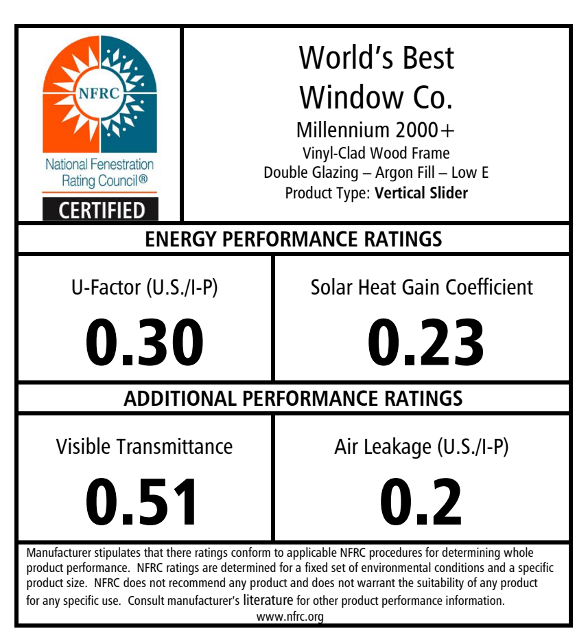
EXAMPLE NFRC Temporary Label