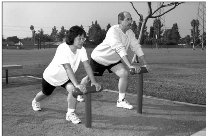
Rynerson Park’s fitness circuit is a popular destination for runners and joggers.