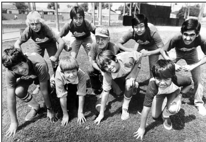
Sports for boys included football.

The program continued to grow, so that Lakewood Youth Sports leagues used every playing field available, including all of Lakewood's parks, Hoover Junior High, Mayfair High, and Lakewood High, every night of the week and all day on Saturdays.