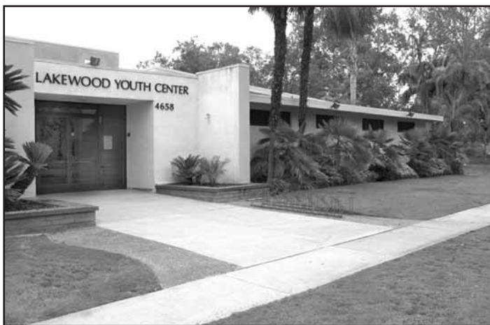
The Lakewood Youth Center was built with contributions from community organizations.