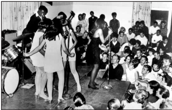
Teens gathered at the Lakewood Youth Center for city-sponsored activities. Here, Tina Turner entertains an enthusiastic crowd.