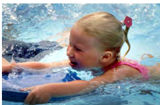
Lakewood summer swimming activities are happening at