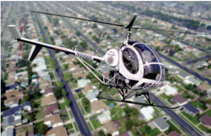
The Sky Knight helicopter patrol program shows the adaptability of the Lakewood Plan to new technologies and new circumstances.

The city council in 2002 adopted an innovative “jaywalking” ordinance to cite thoughtless parents who permit youngsters to make an unsafe crossing to and from their car to school. And a new city ordinance regulated Internet access studios (also called cyber cafés) that had become disorderly hangouts in other cities. Lakewood also acted to limit indoor swap meets (and forbid outdoor commercial swap meets altogether).