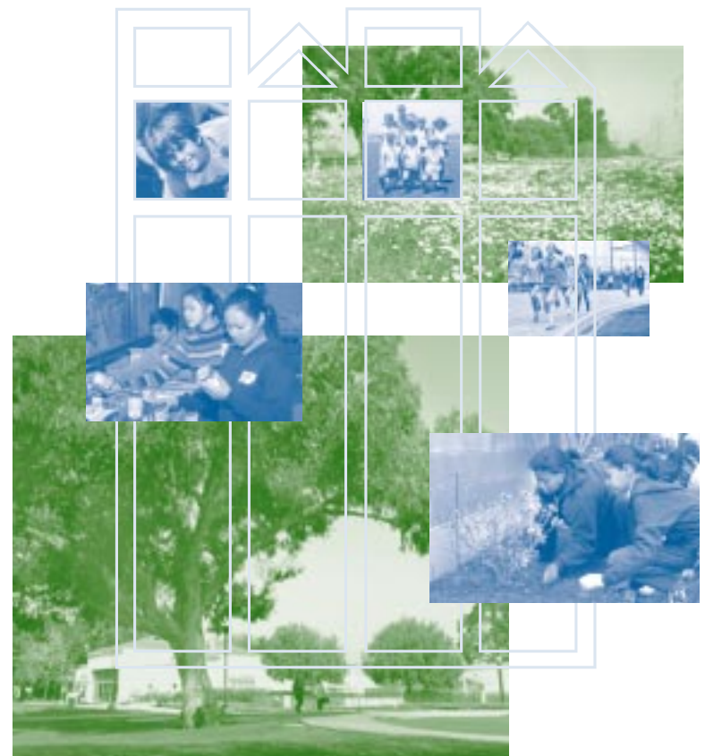
Lakewood is a Tree City USA

The values that Lakewood's founding families established in 1954 still flourish in traditions that continue today – Lakewood Youth Sports, the Pan American Festival, Lakewood Volunteer Day, Lakewood Tot Lot parent cooperatives, Lakewood's many civic and service organizations, Lakewood's PTAs, and the city's religious congregations.