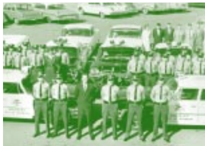
Lakewood Sheriff's Station in 1959