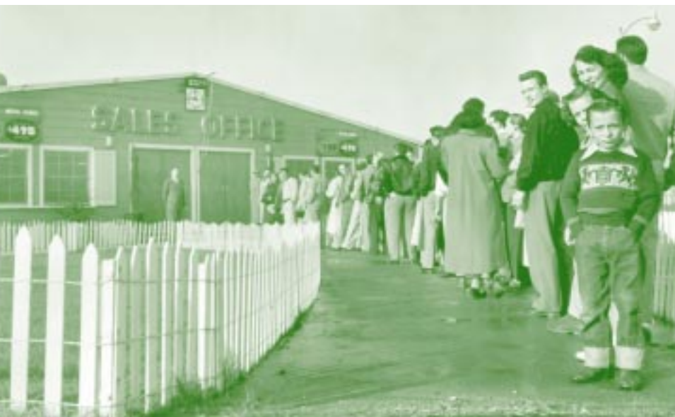
Families stood in long lines to buy a Lakewood home in the early 1950s.