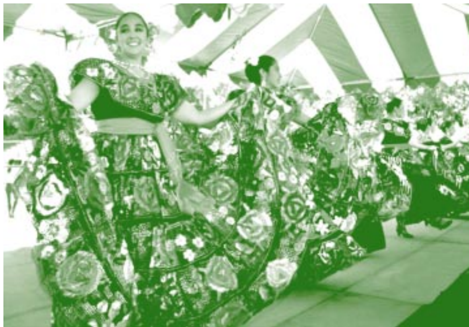
Pan American Festival

Lakewood's annual Pan American Festival is the only celebration in the United States outside of Washington, DC honoring the people and cultures of Latin America.