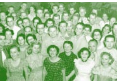
Lakewood residents in 1955

early years, they clung to values that still shape Lakewood: volunteerism, loyalty, good government, service to their community, respect for law, family recreation, concern for youth, and commitment to education.