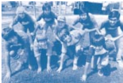
Lakewood Youth Sports began in 1957.