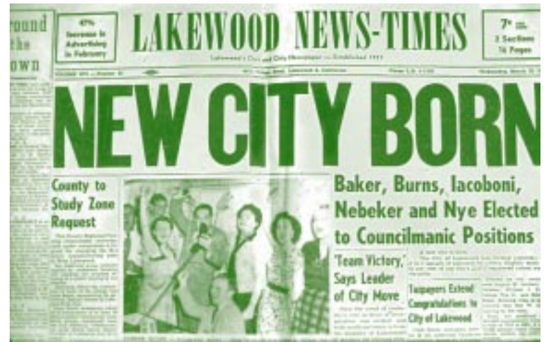
Voters made Lakewood a city in 1954.

Each eleven-foot pillar is topped by the representation of a house. Each pillar has historical photographs that help illustrate the theme of the pillar: the Founders, the Vision, and the Community.