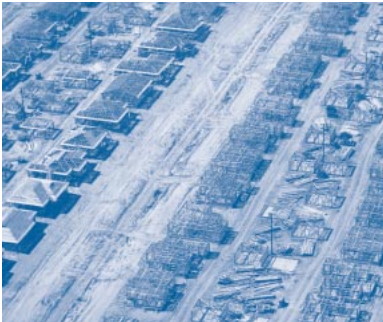
Most of Lakewood was built between 1950 and 1953.

The founders of Lakewood in the 1950s had many hopes for the future. They held values that they passed to their sons and daughters. They created community traditions that you can join in today. These programs and community events demonstrate how neighbors in Lakewood still work together to build their community, just like the early residents of Lakewood did.