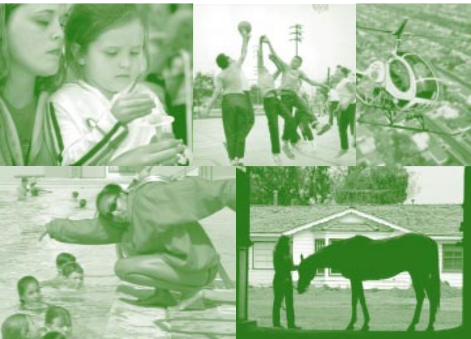
Top: Patriot Day, park sports in the 1960s, Sky Knight helicopter patrol Bottom: swim class, Lakewood Equestrian Center

The values that Lakewood's founding families established in 1954 still flourish in traditions that continue today – Lakewood Youth Sports, the Pan American Festival, Lakewood Volunteer Day, Lakewood Tot Lot parent cooperatives, Lakewood's many civic and service organizations, Lakewood's PTAs, and the city's religious congregations.